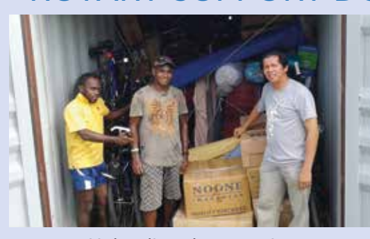
Unloading the container at Don Bosco Tetere

North Balwyn Rotary, in partnership with ASMOAF, have been supporting Don Bosco schools and the Salesian Sisters in the Solomon Islands for the past 14 years.